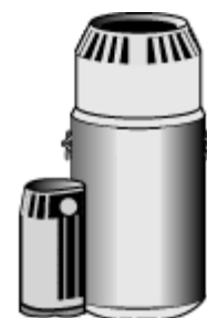
Small portable unit (left) and large stationary unit (right)

SMOKING WHILE USING OXYGEN IS EXTREMELY DANGEROUS